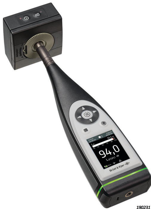
Fig. 2 Type 4231 fitted on the B&K 2245 Sound Level Meter microphone. The calibrator's centre of gravity is positioned very close to the microphone, giving a stable setup

The calibrator gives a continuous sound pressure level when fitted on a microphone and activated.