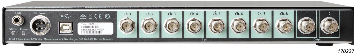
Fig. 1 Rear of Type 3670-A-082 with eight input channels and two output channels

Type 3670 has an embedded microcontroller with built-in 24-bit analogue-to-digital converters (ADC) for the input channels and built-in 24-bit digital-to-analogue converters (DAC) for the output channels. The microcontroller performs all the necessary housekeeping of the ADC, DAC and industry-standard USB 2.0 interface, freeing the host PC to give maximum responsiveness to your application.