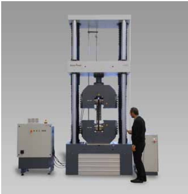
Figure: Zwick Z2000E with hydraulic grips