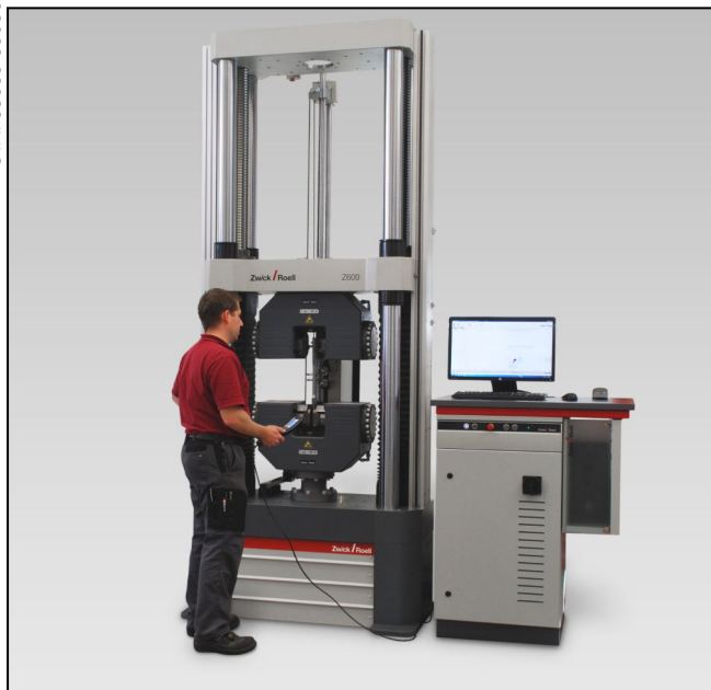
Z600E with hydraulic grips