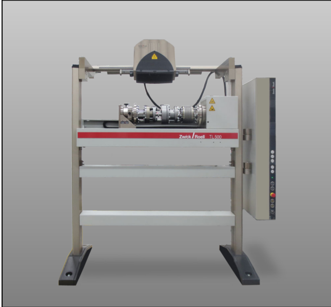
TorsionLine torsion testing machine with testControl II