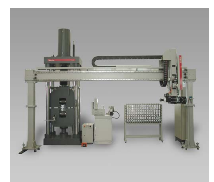
Pic 1: Robotic testing system 'roboTest P'

Robotic Testing System 'roboTest P' (Portal) for Metals