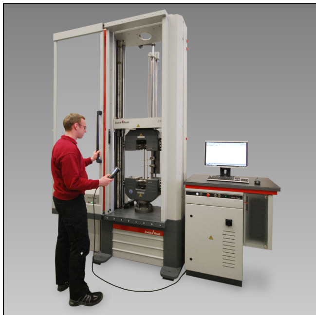
Z400E with hydraulic grips