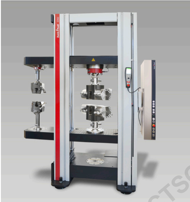
AllroundLine Z250 SNS (lateral test area)

Floor testing machines Z250 of the AllroundLine with lateral test area