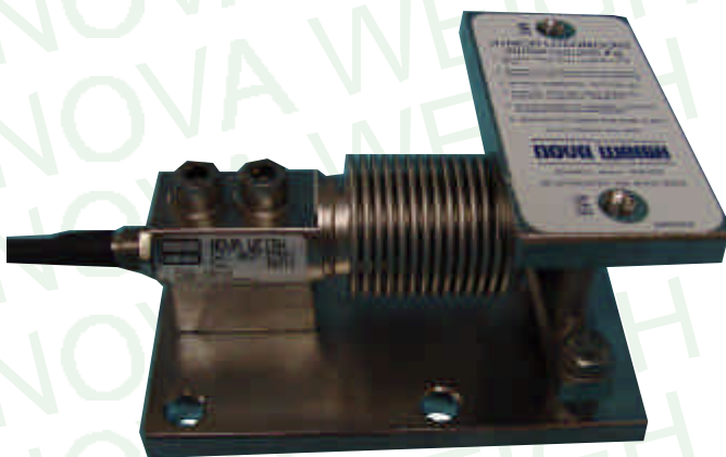
Junior LoadMount with T66 load cell fitted