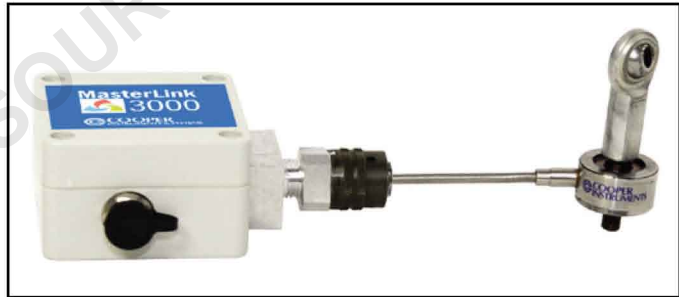
LPM 530 shown with optional MasterLink 3000 Wireless Transmitter. For more information: